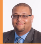
OKPARA RICE USA