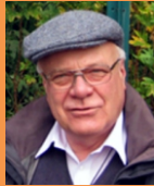
DR LEON FULCHER New Zealand