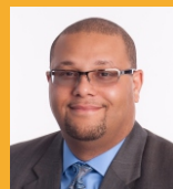
OKPARA RICE USA