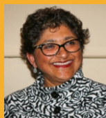
ZENI THUMBADOO South Africa