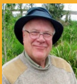
DR LEON FULCHER New Zealand